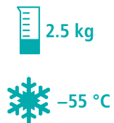
Alpha 1-2 LDplus