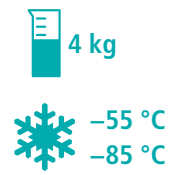
Alpha 1-4 LSCbasic Alpha 2-4 LSCbasic