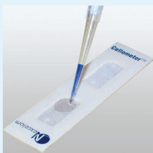
Pipette 20 µl of Sample