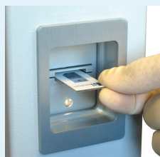
Insert Disposable Slide