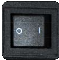
Mains Power Switch