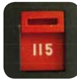
Voltage Selector Switch Set to 115V